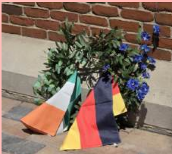
Irish & German flags

🟢 With about 100 people in attendance , the event was such a hit that there's talk of making it annual! 🎉 A big THANK YOU to everyone who came and to AOH for this wonderful collaboration! 🙌