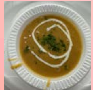
Yummy potato soup from the 6/28 class!