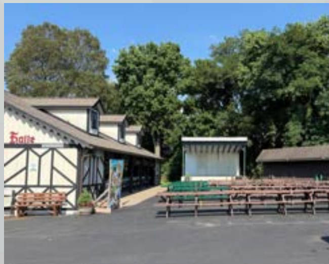
Above & left: The new stage during construction & complete.